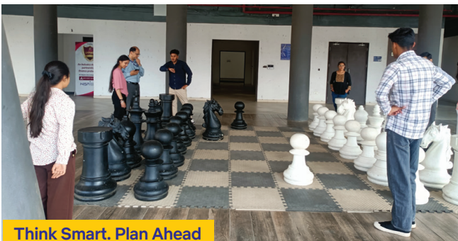
Think Smart. Plan Ahead