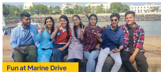
Fun at Marine Drive