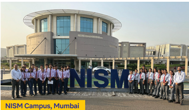
NISM Campus, Mumbai