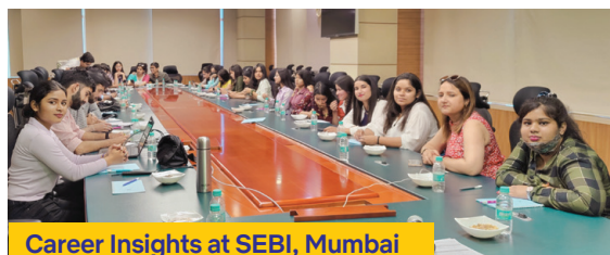
Career Insights at SEBI, Mumbai

Explore Your 03 Years Journey of Learning & Fun