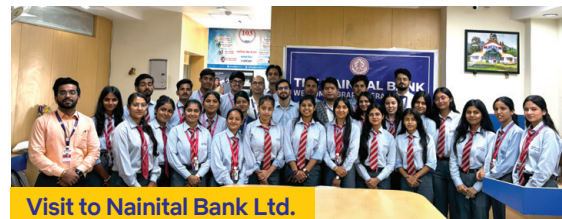
Visit to Nainital Bank Ltd.